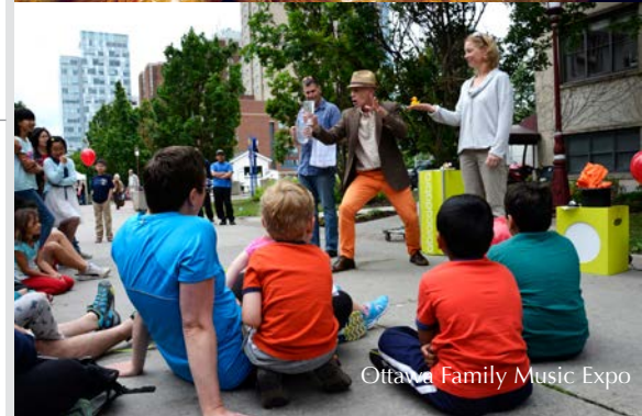
Ottawa Family Music Expo