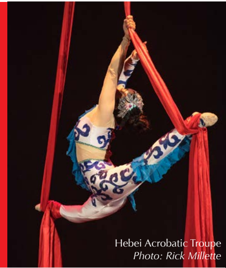
Hebei Acrobatic Troupe