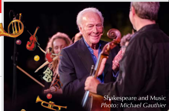
Shakespeare and Music